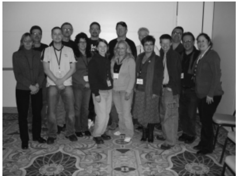
CUPE 1975 delegates at the Convention